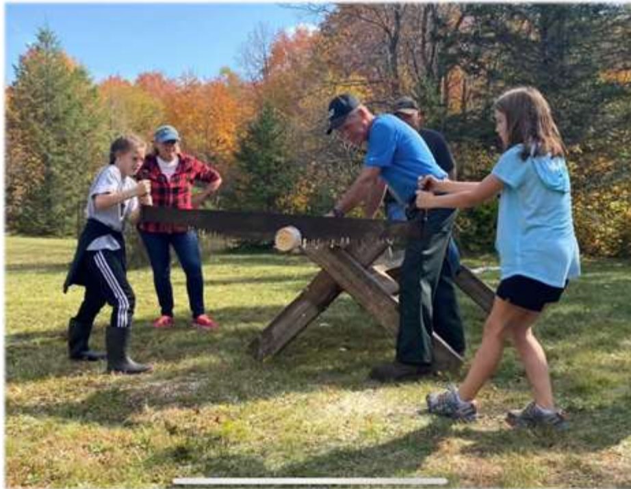
27 fifth and sixth graders from Ewen-Trout Creek in Ewen, MI visited the Ottawa National Forest in October 2021.