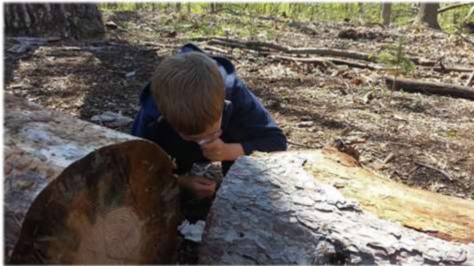
90 first and second graders from Grayling Elementary School visited the Au Sable Institute in October 2021