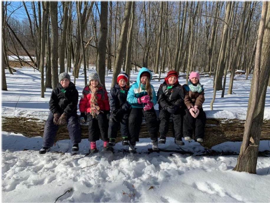
60 third graders from Montabella Elementary in Blanchard, MI visited the Forest Hill Nature Area in Alma in May 2020.