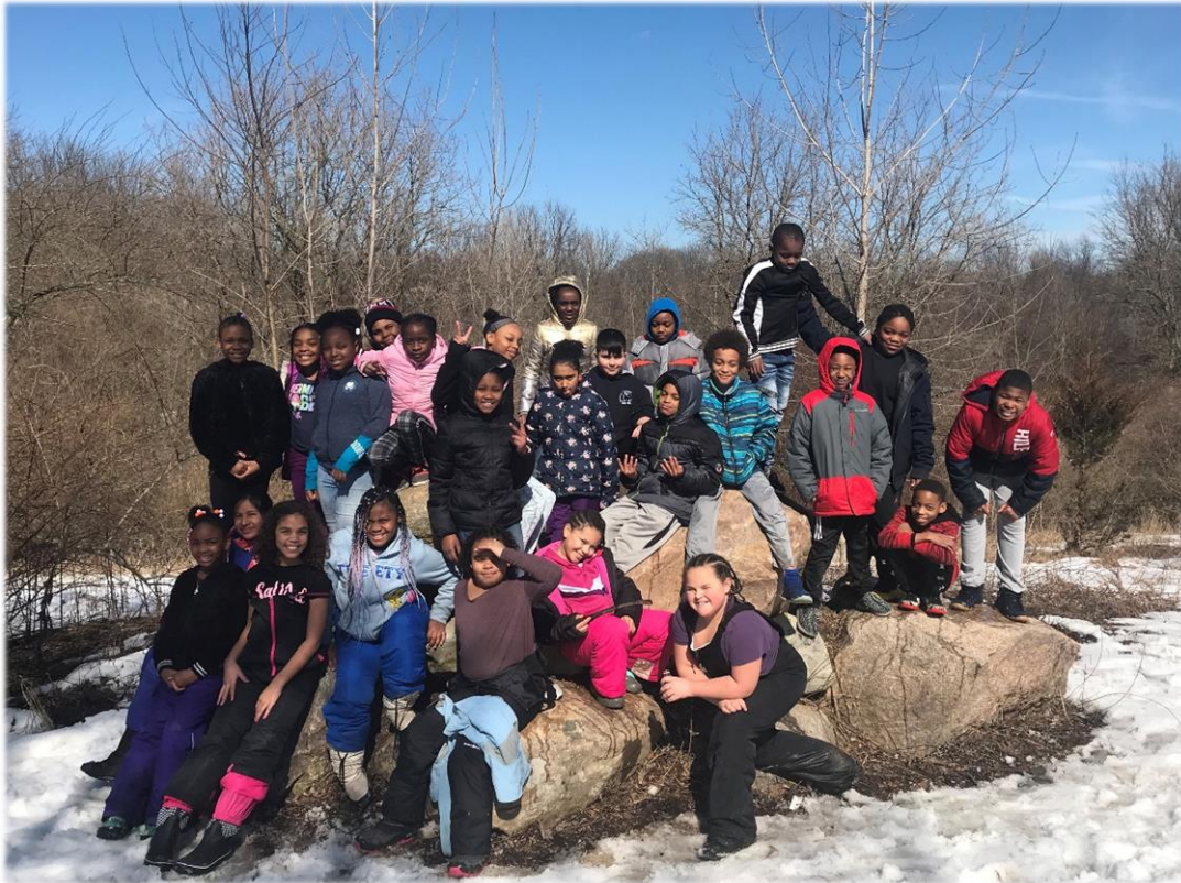
80 fourth and fifth graders from Lincoln International Studies School in Kalamazoo visited the Kalamazoo Nature Center in March 2020