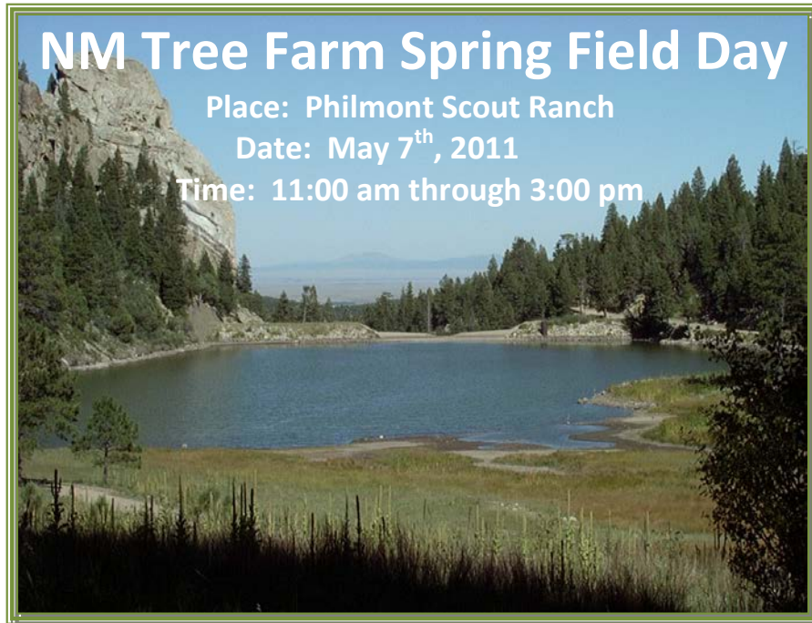
(Cimarroncito Reservoir, view from the Demonstration Forest visitors pavilion)