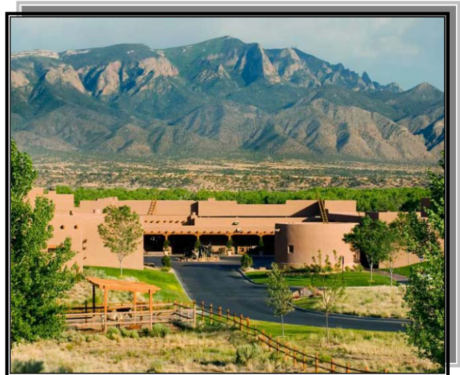
(Hyatt Tamaya Resort & Spa)

planning programming for Tree Farmers of all ages, so bring the young Tree Farmers in your family. With room rates at just $89/night negotiated especially for our convention goers, this is one you can't miss! Look for registration information in the March/April edition of Tree Farmer Magazine. Be sure to check www.treefarmssystem.org for the most up to date information. We hope you and your family can join us!