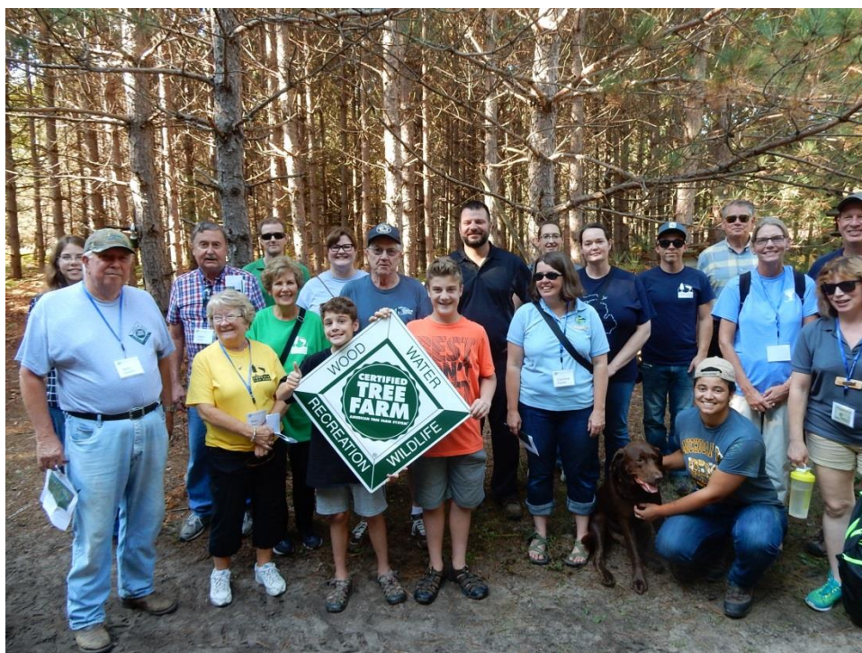
Field Day at the Pierce Family Tree Farm in Iosco County at the Michigan Forest Association and Michigan Tree Farm meeting in September

Helping families care for their forests since 1941