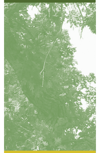
Recommendations on Implementing your Management Plan